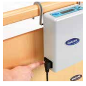
Simply switch on, no additional adjustments required.