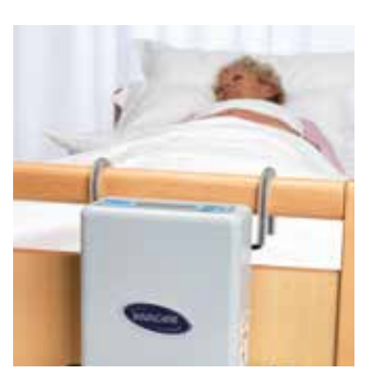
The patient is now lying on an alternating surface.