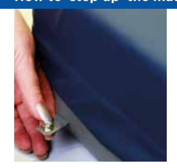
Detach the pipes from the foot end of the mattress.