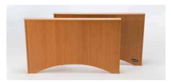
Select design for Medley Ergo

The homely design of Medley Ergo Select can also be retrofitted (optional).