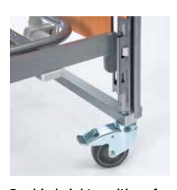
Double height positions for bed ends

Adjustable height range for Medley Ergo of 330-730mm or 400-800mm.