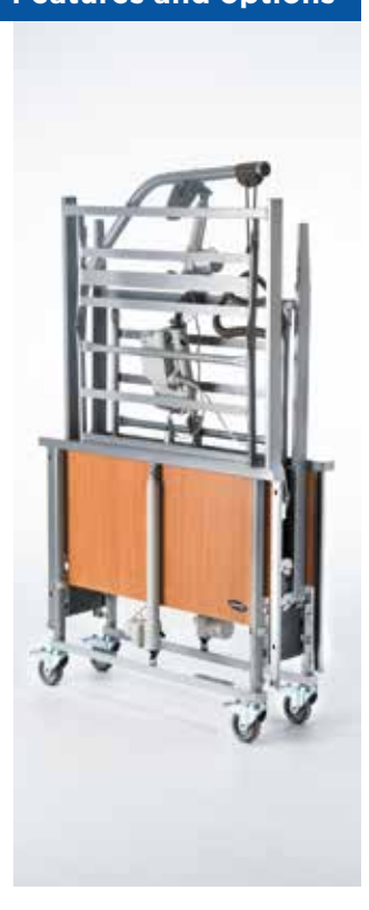
Easy to transport Medley Ergo beds are easy to assemble and dismantle and can be transported using transporter kits (optional).