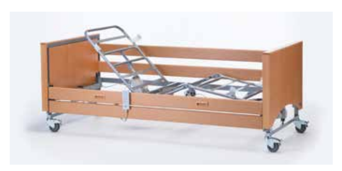
Medley Ergo Select

The Medley Ergo Low is dual height adjustable, offering a 210-610mm and 280-680mm height option to suit a wider range of needs.