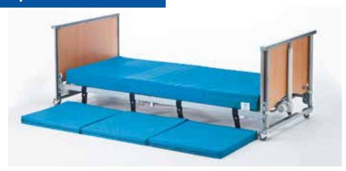
Medley Ergo Low (21cm lowest height)