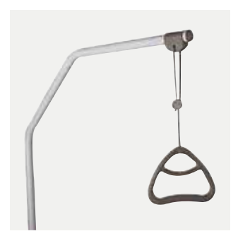
Lifting Pole Can be adjusted in both height and depth (optional).